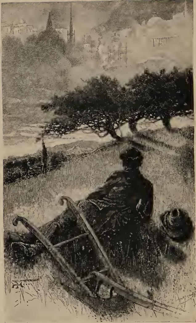
“THESE ARE THE SPIRES THAT WERE GLEAMING